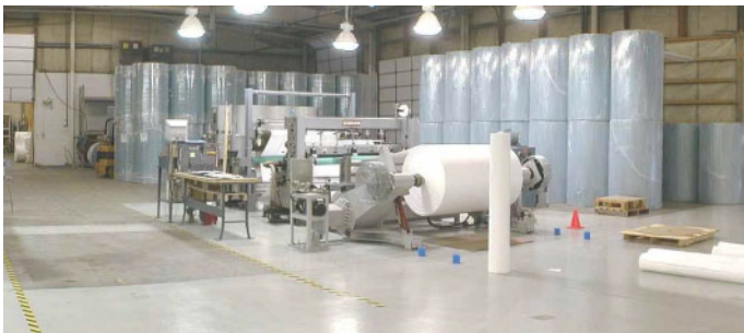
76" (1930 MM) Micrex system processing a Spunlace wipe

The Micrex Process is a unique, uncomplicated mechanical technology to impart functional (stretch, extensibility, bulk) and esthetic (softness, drape, hand) qualities to a wide range of web structures. There are five configurations of the Micrex/Microcreper: Comb Roll, Rigid Retarder, Bladeless, Flat Blade and Two Roll.